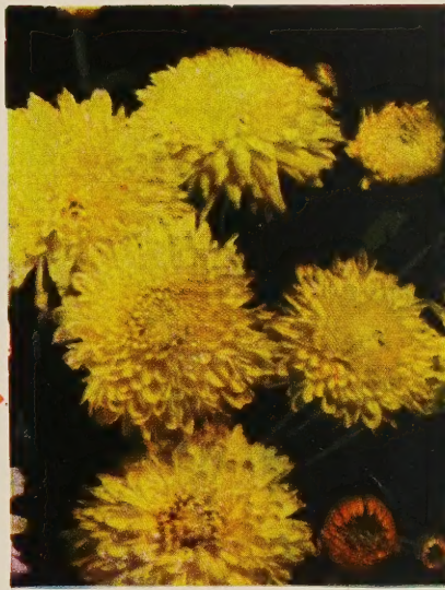
DELIGHT. 60c each; 3 for $1.50